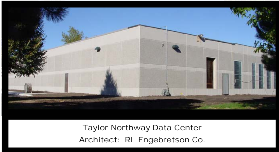
Taylor Northway Data Center Architect: RL Engbretson Co.