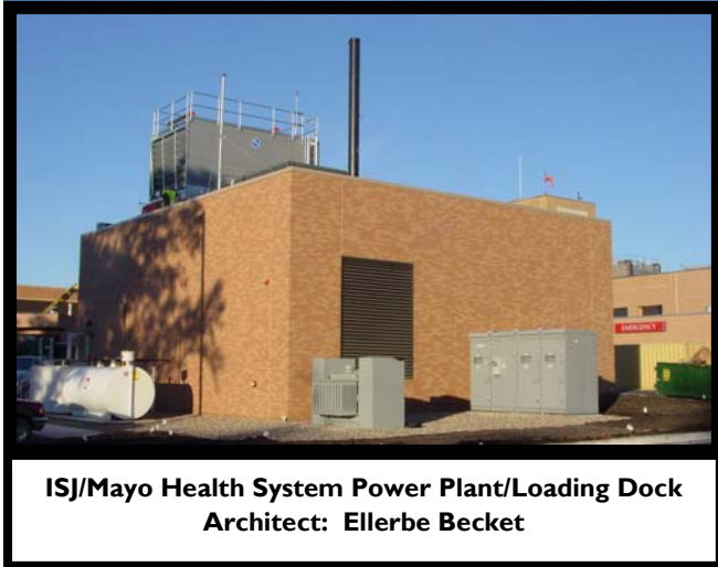
ISJ/Mayo Health System Power Plant/Loading Dock Architect: Ellerbe Becket

We are in the final stages of the Immanuel St. Joseph's- Mayo Health System Power Plant / Loading Dock project. This Ellerbe Becket-designed project will supply heating and cooling capacity for a Cardiology addition that has just begun and also a future Oncology addition. The project includes a new two-level building that contains a 600 ton chiller, a 750 kW emergency generator as a backup for this building in case of a power failure, and a 108 foot long tunnel that provides access to the main hospital building. In the existing boiler plant building a 200 hp boiler was replaced with a new 600 hp boiler that will provide additional heating capacity. The project also includes a loading dock addition that improves materials handling