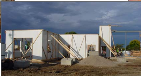
Snell Car Wash