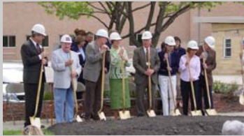
ISJ Oncology Addition-Mayo Health System