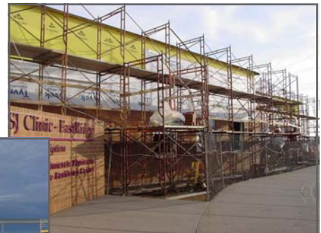
ISJ EastRidge Clinic Addition