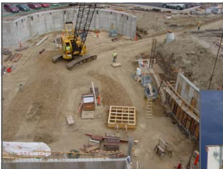
ISJ Oncology Addition