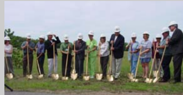
ISJ St. Peter Clinic-Mayo Health System