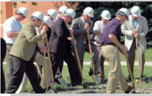
Academic Bldg-Bethany Lutheran College