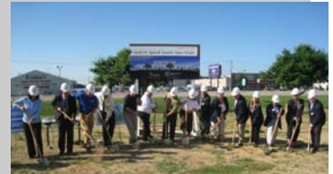
Snell Hi-Speed Tunnel Auto Wash