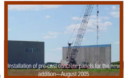
Installation of pre-cast concrete panels for the new addition—August 2005